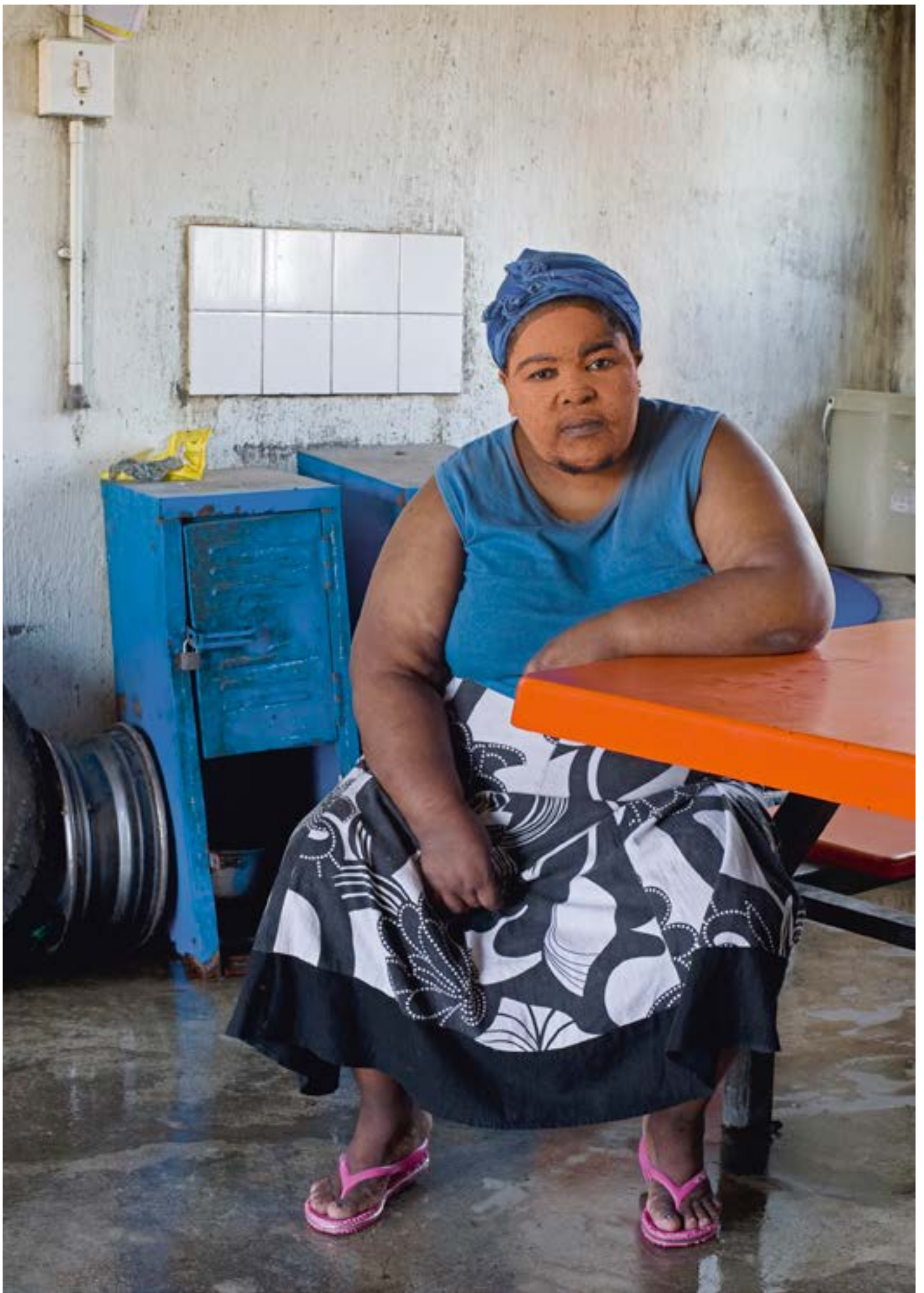
Soweto