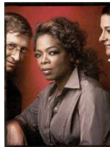
BILL & MELINDA GATES AND OPRAH WINFREY