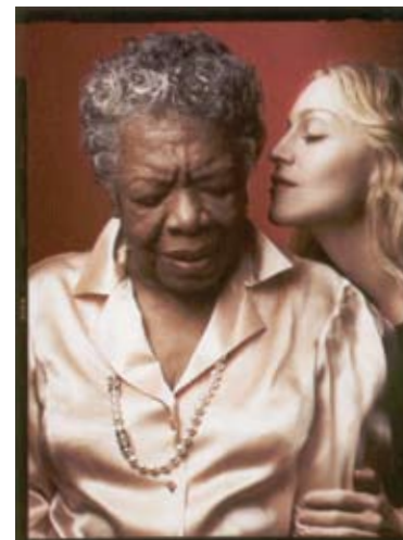
MAYA ANGELOU AND MADONNA