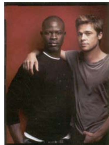
DJIMON HOUNSOU AND BRAD PITT